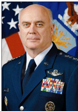
Gen Carrol H. "Howie" Chandler

Contributions through the AFAF are among the best investments we can make in our own community. In 2007, PACAF Airmen pledged $619,000 to the overall AFAF campaign while receiving back over $1.6 million in Air Force Aid Society assistance