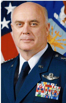
The PACAF Commander encourages contributing to the Air Force Assistance Fund A2